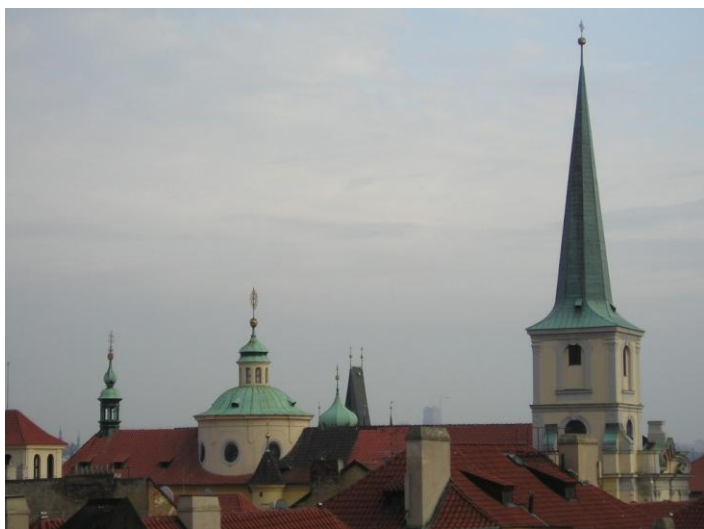
St. Thomas Church: established July 1, 1285 by King Vaclav II