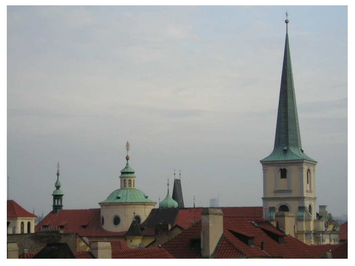
St. Thomas Church: established July 1, 1285 by King Vaclav II