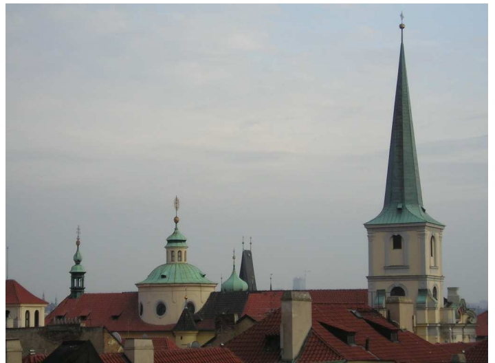
St. Thomas Church: established July 1, 1285 by King Vaclav II