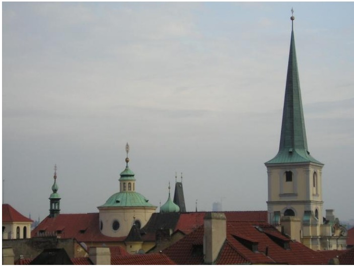
St. Thomas Church: established July 1, 1285 by King Vaclav II